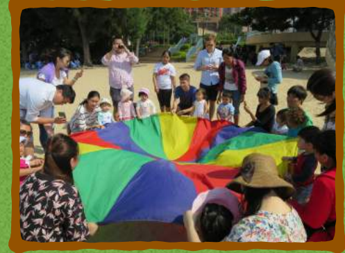
Playgroup went to Gold Coast Beach