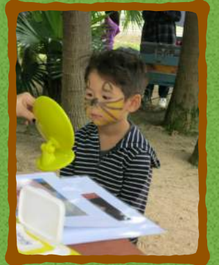
PN-KG went to Penfold Park